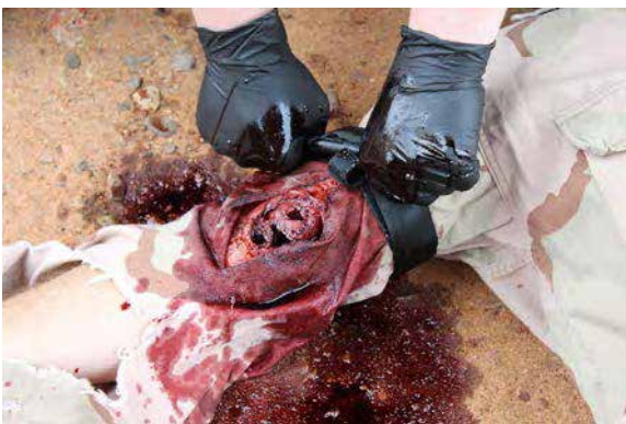
Tourniquet application to an upper extremity life threatening bleed