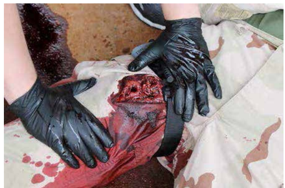
Tourniquet application to a lower extremity life threatening bleed