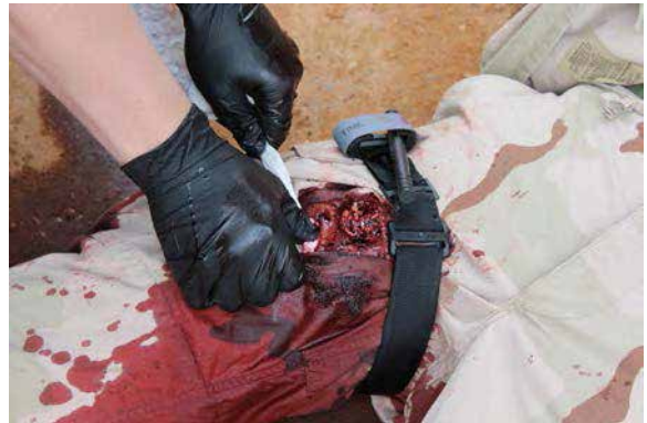
Packing of a lower extremity life threatening bleed