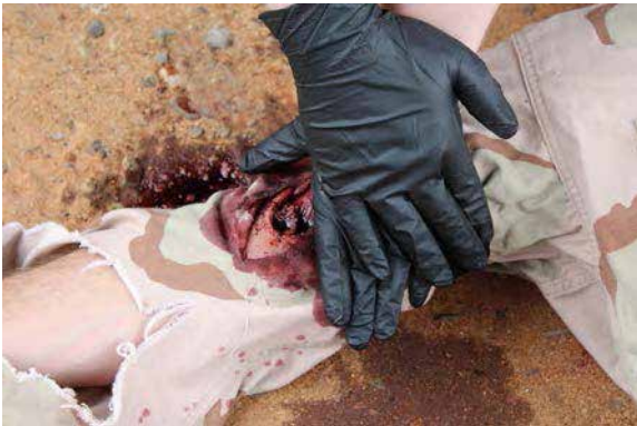
Internal hemorrhage compression applied to an upper extremity life threatening bleed